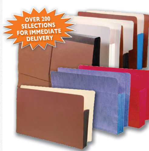
EXPANSION POCKETS & WALLETS