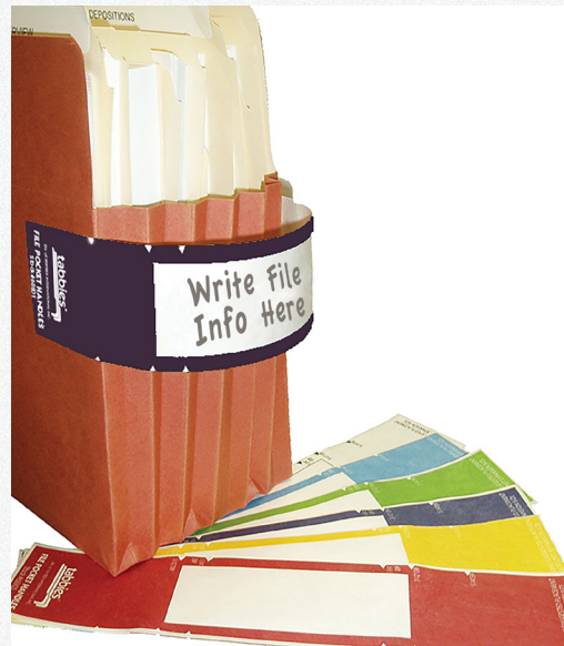
FILE POCKET HANDLES